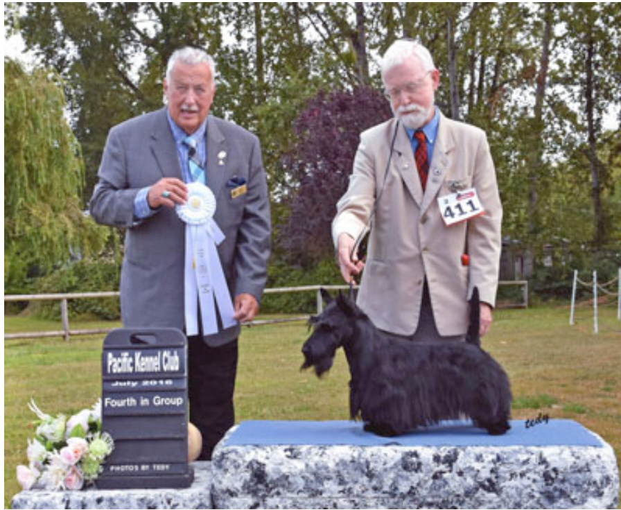
Ch. Glenfraser's Black Watch Piper

Judging at the Campbell River Dog Fanciers shows, July 30, 31, and Aug. 1, at the start of the popular Vancouver Island circuit was very inconsistent, particularly the first two days when 7 different dogs shared the 8 group placements in a field of about 20 terriers. The first day Denise Cornelssen took Janice Lewis' class Cairn not only to win the group but on to Reserve BIS (and the following two days the dog ended up with Reserve Winners in the classes) with no other club members placing. The second day Judith Byrne seemed to be looking for free stacking Terriers, and so found the best one able to do that in the afternoon heat with Brian Kruse's Mini Schnauzer Specials puppy (which she did not take on to either BIS or BPIS). She also placed the Kerry, Irisblu The Harpist , owned by Anita Norman and Harold Quigg as Group 2 nd , and Jackie Marriott's Scottie, GCh. Dunsmuir Black Ice Encore , as Group 4 th . The last day, judging was a bit more typical as William Byrne gave the group to the Kerry Blue (and took it on to Reserve BIS) with Larisa Hotchin's Welsh, Ch. Darwyn Here For a Good Time going Group 2 nd . The Mini Schnauzer puppy went BPIS under Byrne.