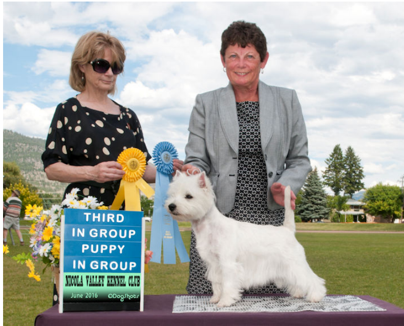
Ch. Cleghorn Fortune and Glory