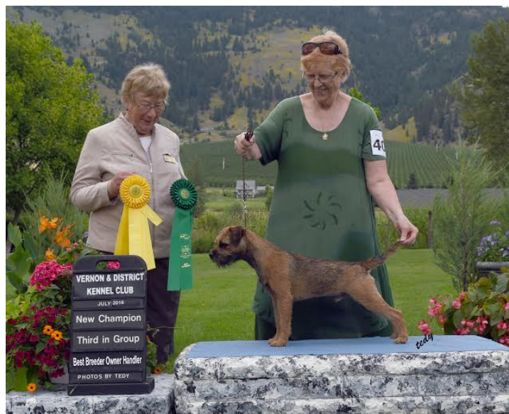
New Ch. Fernrigg's Steve Martin