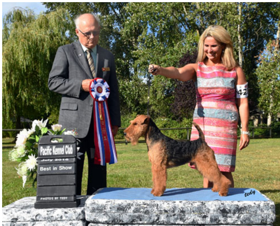
Ch. Darwyn Here For a Good Time