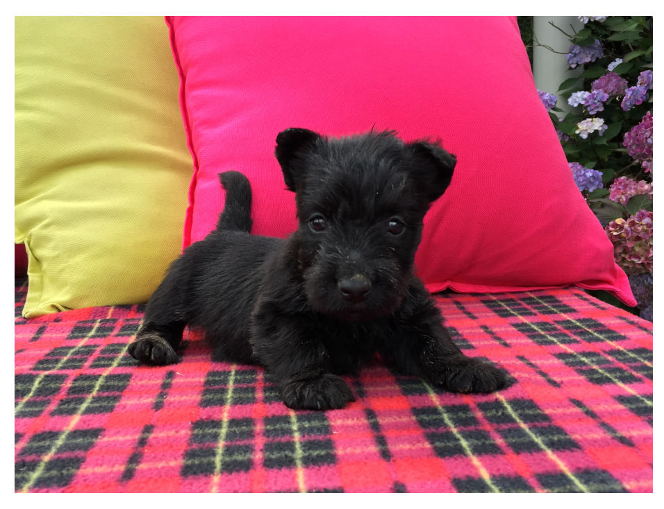
This 5-week old Scottie wishes you a happy spring!

Cheryle Goodfellow, 975 Munro Street, Kamloops, B.C. V2C 3G2