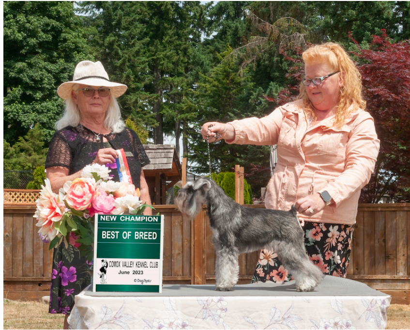
New Ch Empire StarGate Continuum “Mia”