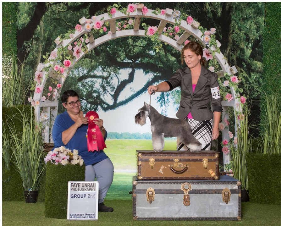
New *Ch Empire Inferno At Kampfner “Hottie”