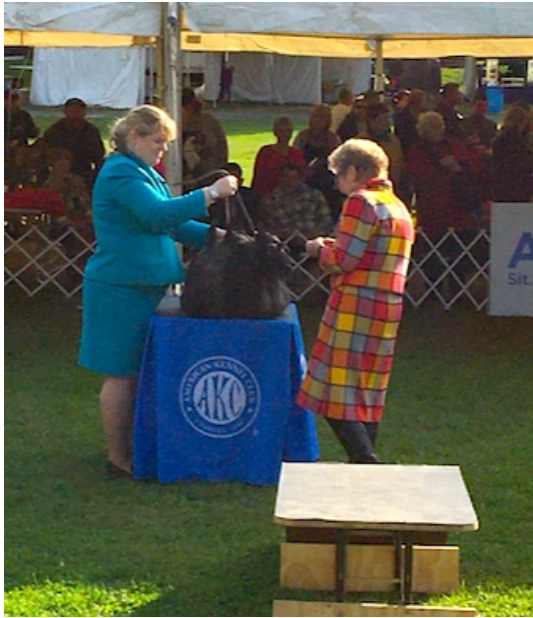
Scottie Brace Group judging