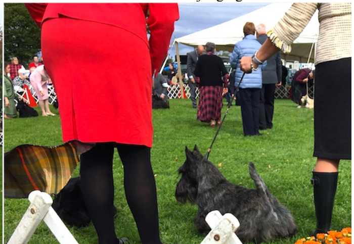
Scottie BOB winner