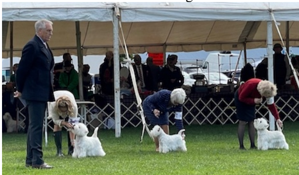
Westie BOB ring