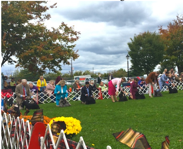
Scottie BOB ring