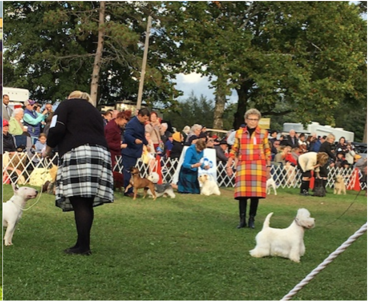
Westie being judged in Group