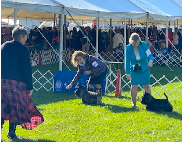
Scottie Winners Dog

Best of Breed judging presented a lot of practical problems in the more populated breeds, such as 42 Specials in Scotties, 28 in Cairns, 34 in Kerries, 25 in Schnauzers, 22 in Borders and so on. It was only feasible to have about a dozen dogs in the ring at any one time. So, in many breeds, the males came in first, and an initial cut was made. With Scotties, this meant the first half of the male Specials went through this process, followed by the second half, and then the first selection of all the male Specials came in and there was a second cut, with frequent sparring of groups of three. Not only did the judge have to remember a lot of dogs, and the Ring Steward needed to keep track of the various cuts, but the dogs and handlers had to be at their best for an extended period of time, with mounting tension at every cut. Then the same process occurred with the female Specials, and then the final selection of Best of Breed contenders came in for the grand finale, the results of which included the various Select and Award of Merit recipients. Those of us at ringside marveled at how the judge managed to make all these distinctions, but needless to say, the final winners were an amazing group of dogs!