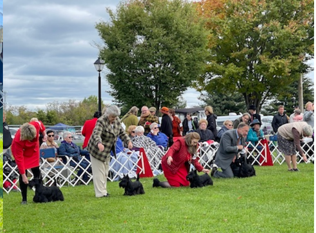
Scottie female judging