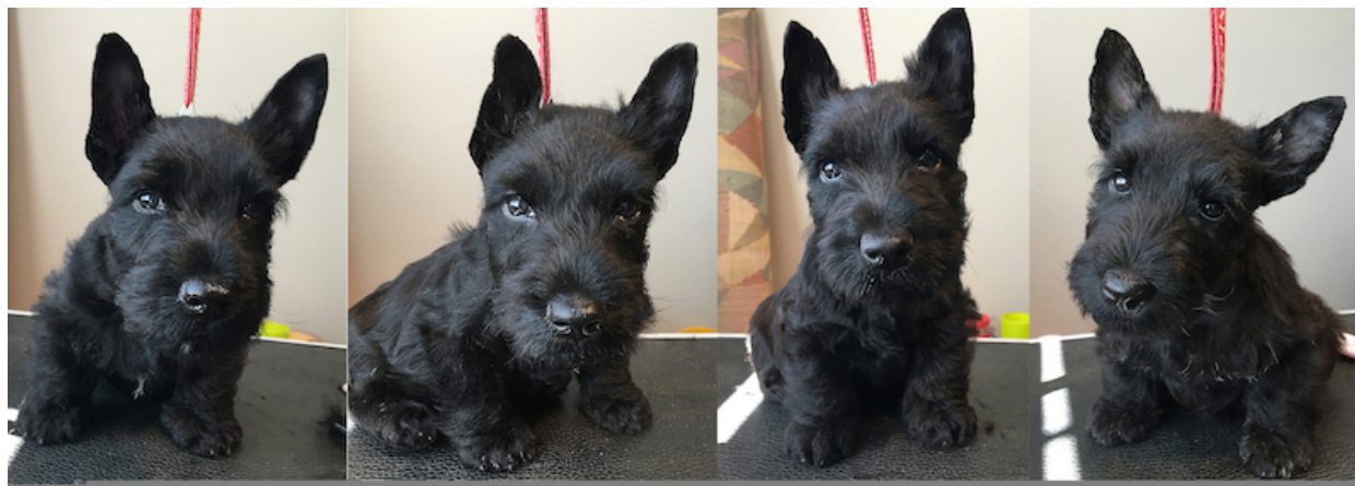
Sadie's litter at 7.5 weeks (l. to r. Falkland, Munro, Sassy, Maggie)

http://www.sfu.ca/~truax/Sadie%20Litter/glenpup18.html