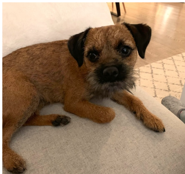
Ooshkee is excited to attend her first dog show soon!