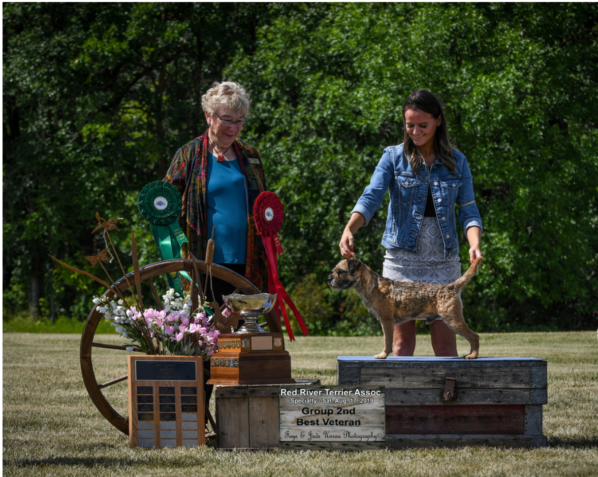
MBISS MBIS Am GCh. Br Can GCh. AOM Benchmark's Winning Goal RN (Can/Am Ch. Roschel's Call Me Mister ex Ch. Conundrum Royal Blue)