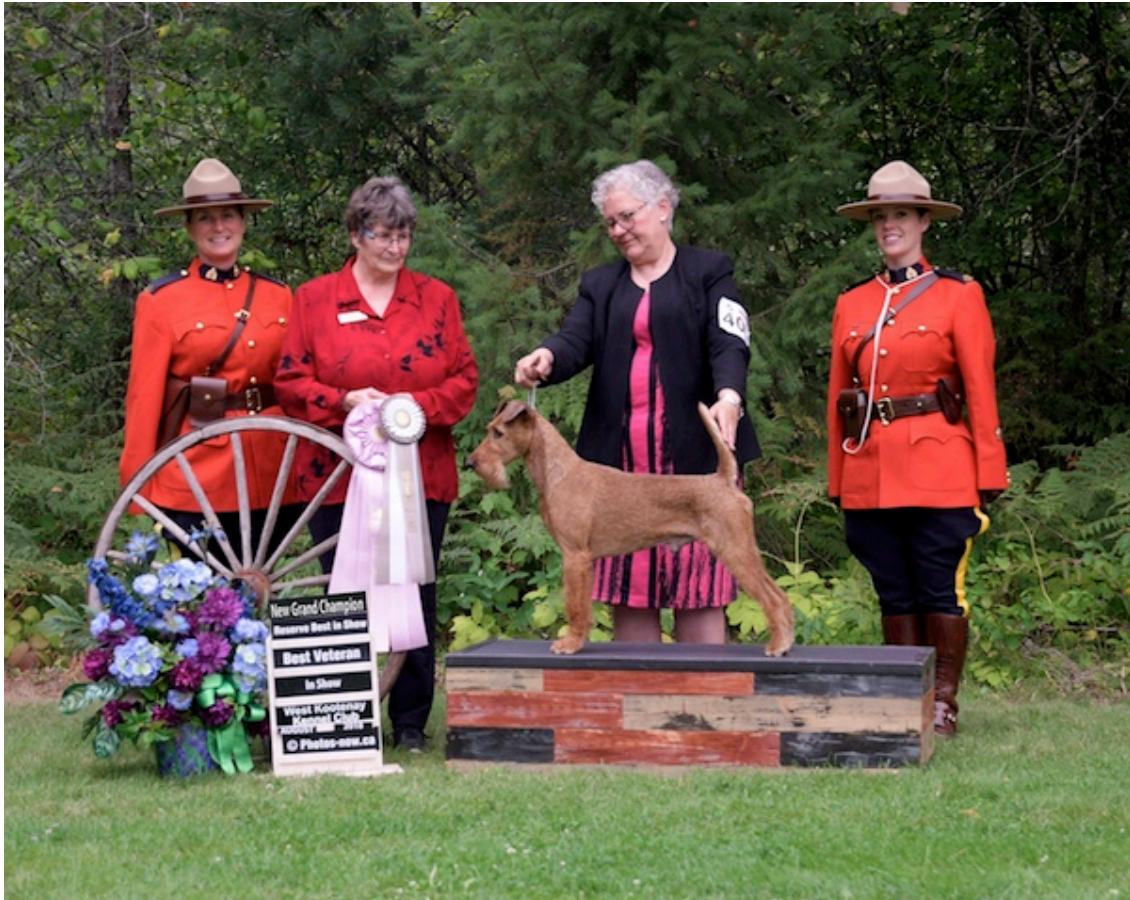
BPIS RBIS BVIS Am GChB/Can GCh. Red Branch d'Artagnan of the Ring CGN