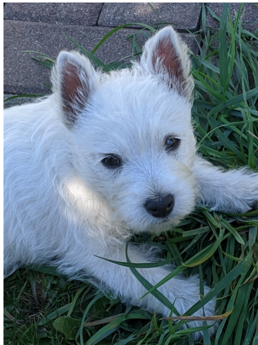
Heather Tomlins' new puppy (Jinx) wishes you a happy fall!

Cheryle Goodfellow, 975 Munro Street, Kamloops, B.C. V2C 3G2