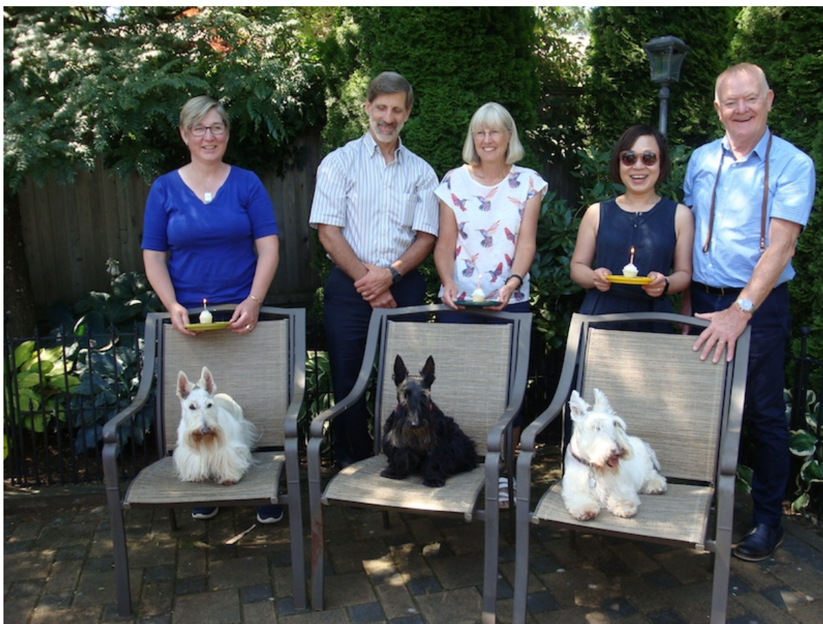
Trotters' Scotties celebrating their 11 th birthday