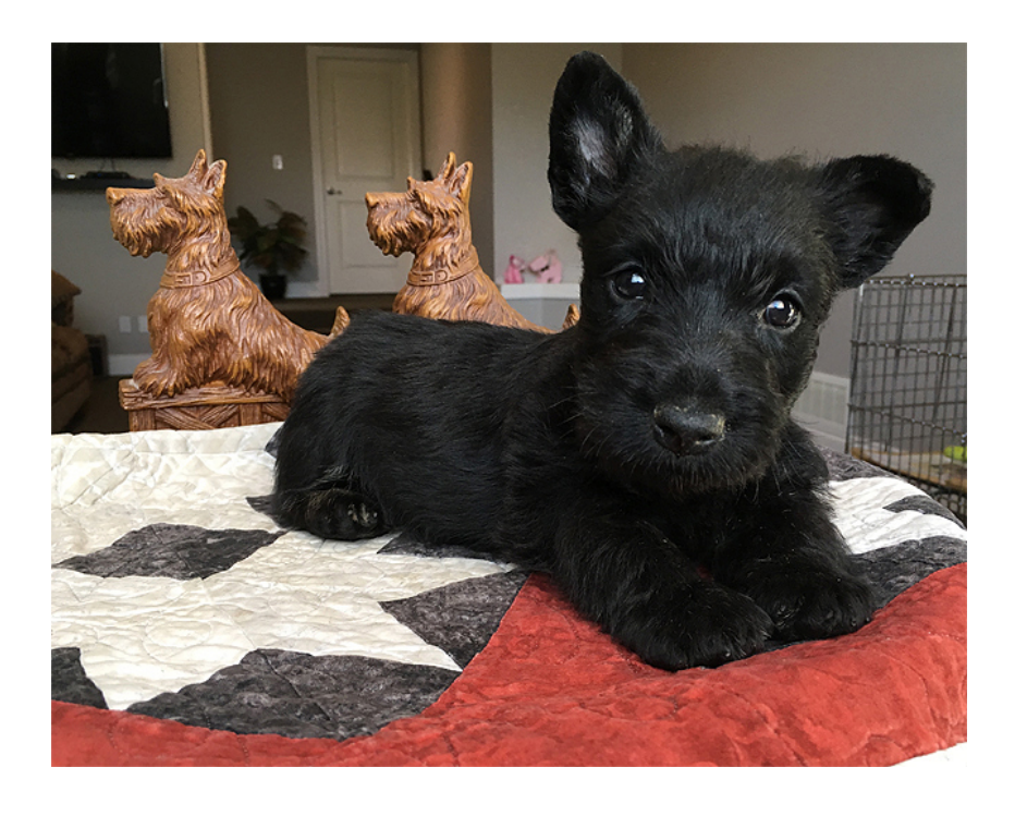
This 6-week old Scottie wishes you a happy summer!

Cheryle Goodfellow, 975 Munro Street, Kamloops, B.C. V2C 3G2