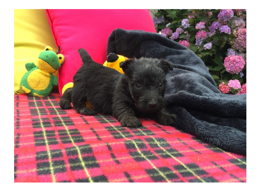
This 5-week old Scottie wishes you a happy spring!

Cheryle Goodfellow, 975 Munro Street, Kamloops, B.C. V2C 3G2