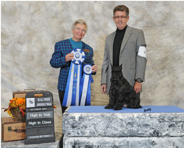
Specialty HIT: Can/Am Ch. Advocate's Just Jack