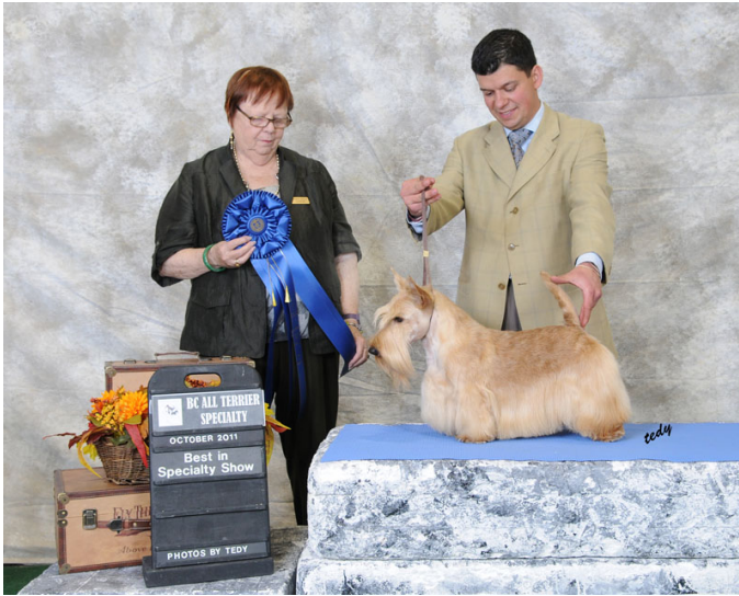
Specialty Group 1 st : Ch. Stalwart's Radiant Oracle